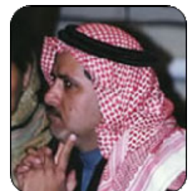
Saudi Najdi Arab, Muslim 14.9 million, Unreached