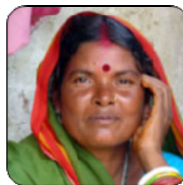
Koiri of India, Hindu 9.2 million, Unreached